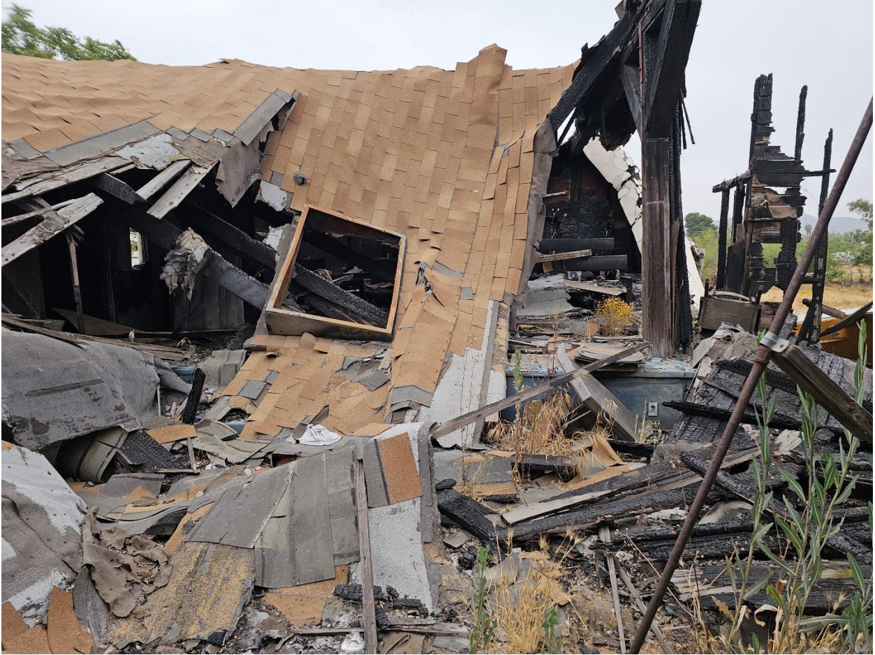
Photograph 3 – illustrates the site looking east, collapsed back half of church