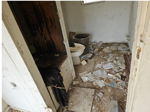
Photograph 2 – illustrates the back shed