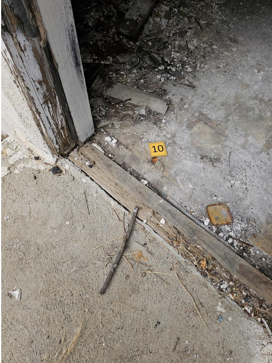
Photograph 6 – illustrates sample 10, vinyl tile in restroom (no asbestos present)