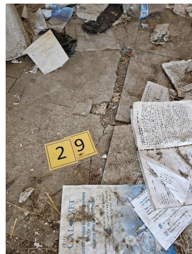
Photograph set 7 – illustrates samples inside shed, flooring (no asbestos present)