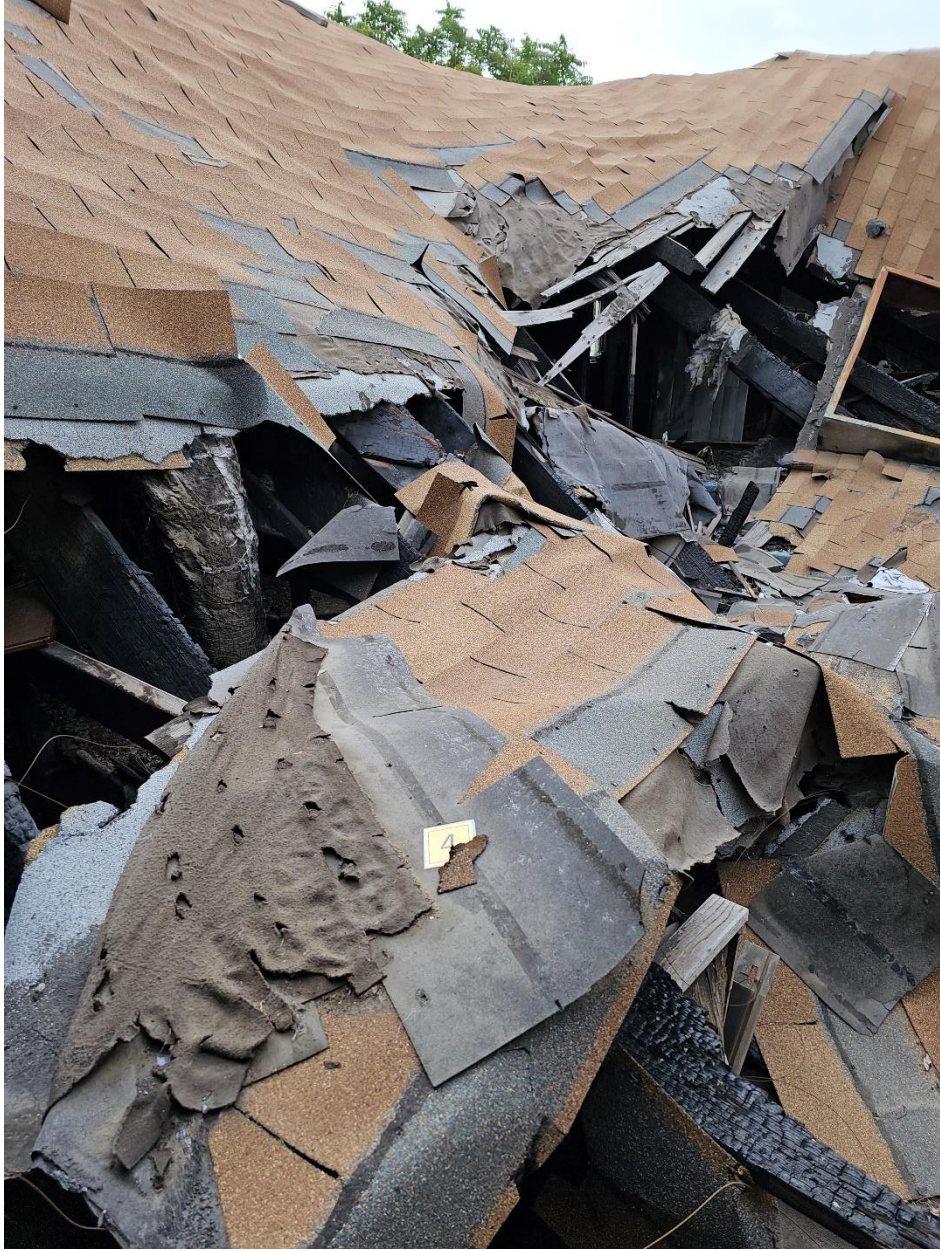
Photograph 4 – illustrates sample 4, roofing (no asbestos present)