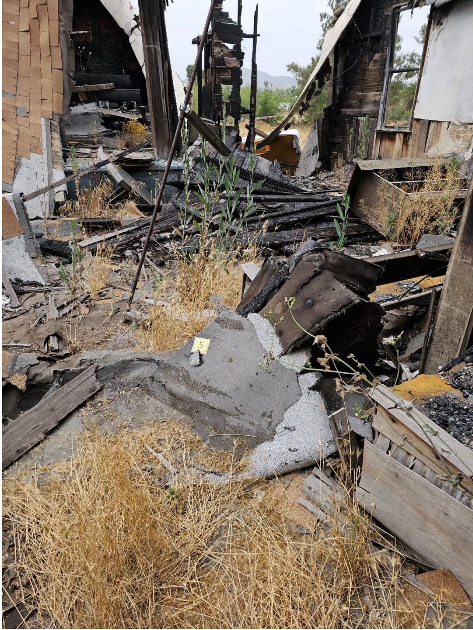
Photograph 5 – illustrates sample 5, roofing (no asbestos present)