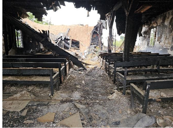
Photograph 1 – illustrates site, church looking South